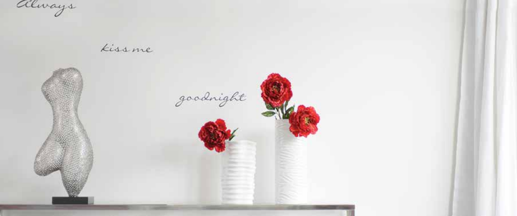
The spacious master suite, with its view of the treetops, provides plenty of storage for the couple's essentials as well as a restful and romantic escape after a busy day.